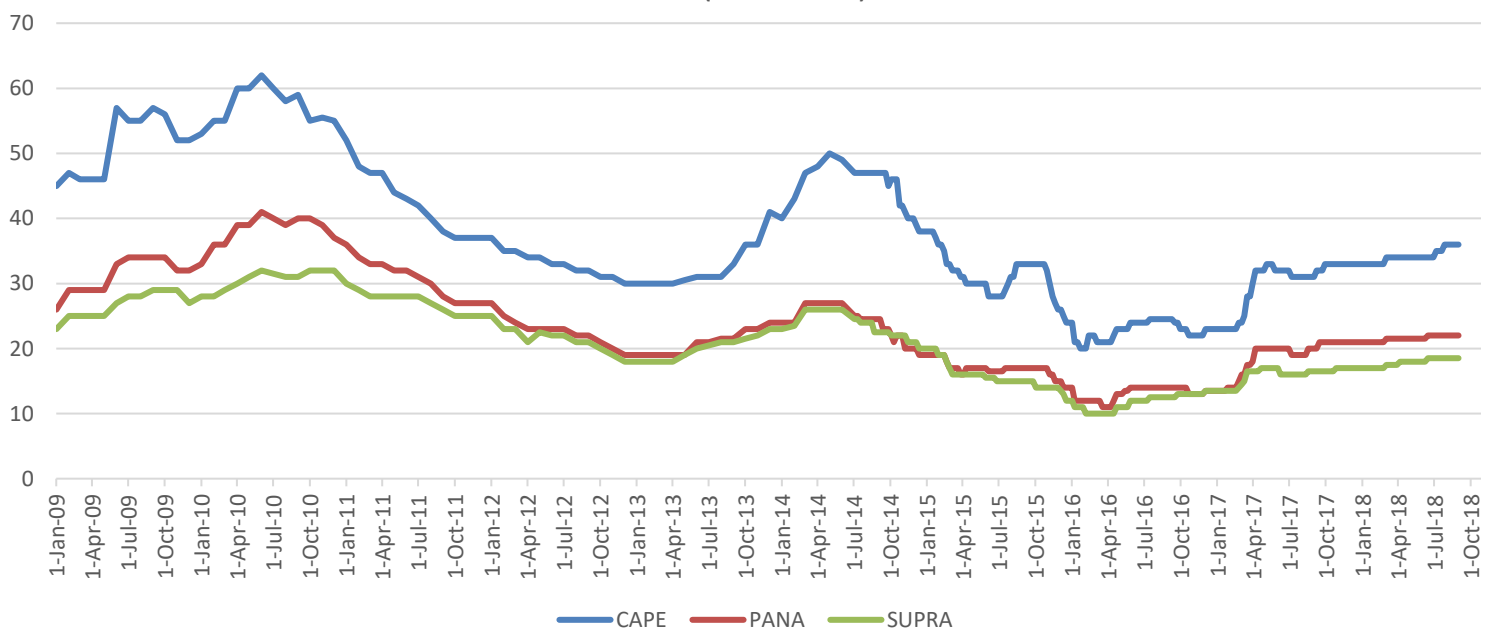
COMPASS MARITIME BULKER VALUES (5YRS OLD)